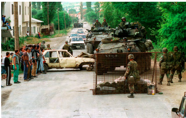
Left: U.S Marines' road block near the village of Koretin, Kosova, checking for weapons, 16 June 1999

The inflammatory issue was the order by officials in Pristina to replace Serbian vehicle licence plates with Republic of Kosovo licence plates. The border between Kosovo and Serbia, the Merdare crossing, important for road freight and has international rail links, was closed.