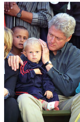
Left: US President Bill Clinton with Albanian children during his visit to Kosovo, June 1999 - refugee camp near Skopje, Macedonia

Further information: https://worldinfozone.com/facts.php?country=Serbia