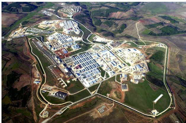
Left: Camp Bondsteel, the main base of the United States Army under KFOR command in south-eastern part of Kosovo near the city of Ferizaj