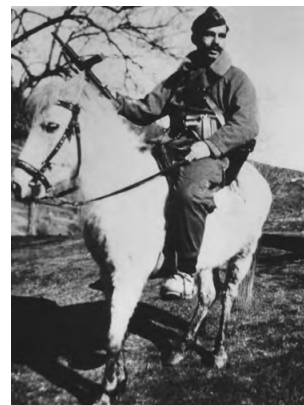
Left: Fadil Hoxha, vice-president of the Socialist Federal Republic of Yugoslavia, 1978 to 1979